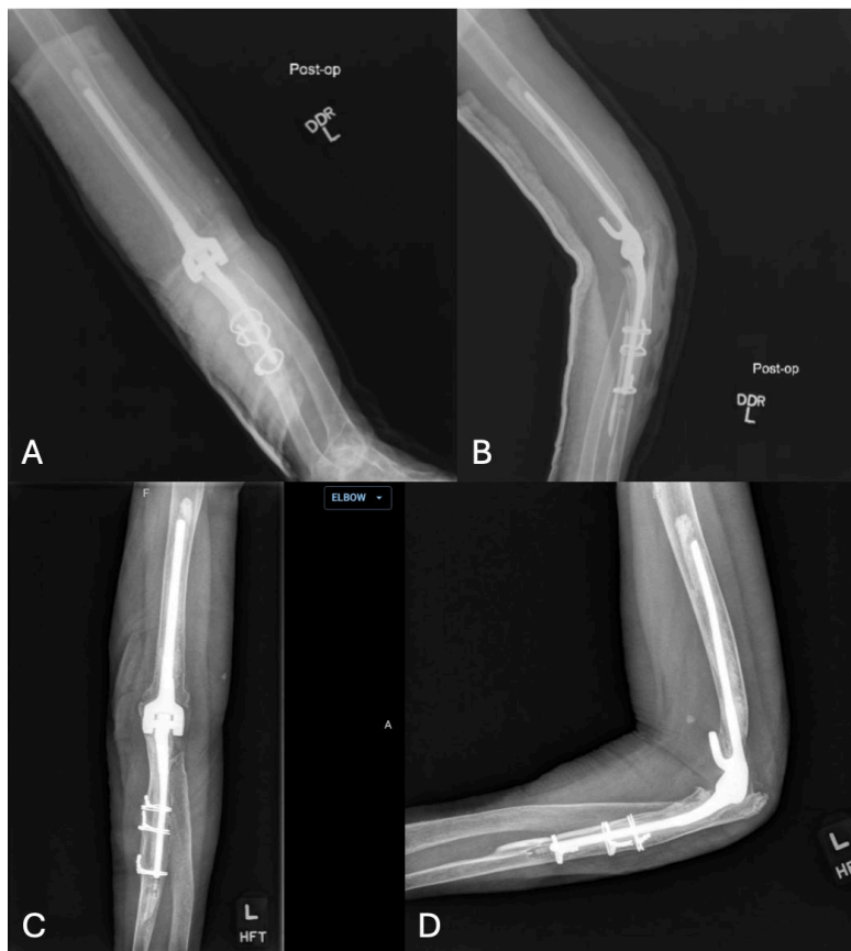
Figure 2. Immediate post-operative (A,B) and 9-year follow-up (C,D) orthogonal radiographs demonstrating allograft strut incorporation following an ulnar sided strut allograft reconstruction for a mal-rotated ulnar component resulting in severe bushing wear and metallosis.